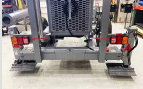
EU portable wind machine required safety taillights.

These items can be purchased as an additional package and are required in the EU.