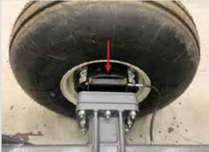
EU portable wind machine is equipped with electric, over hydraulic disc brakes for safe towing and hand-held brake controller.