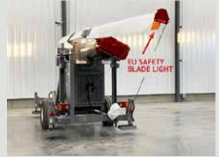
EU portable wind machine required blade light for transport.