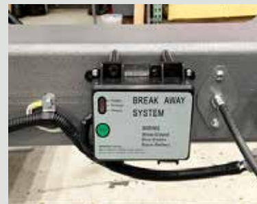
The EU portable wind machine is equipped with a break away system that will activate the brakes should the trailer become uncoupled during towing.