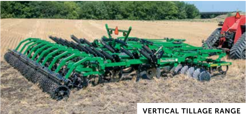
VERTICAL TILLAGE RANGE

Heavy duty toggle trip shanks with 2,450lbs (1,111kg) trip force