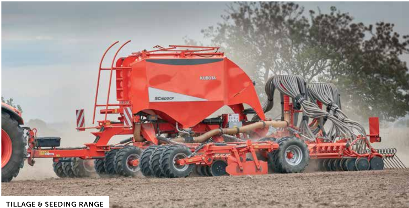
TILLAGE & SEEDING RANGE