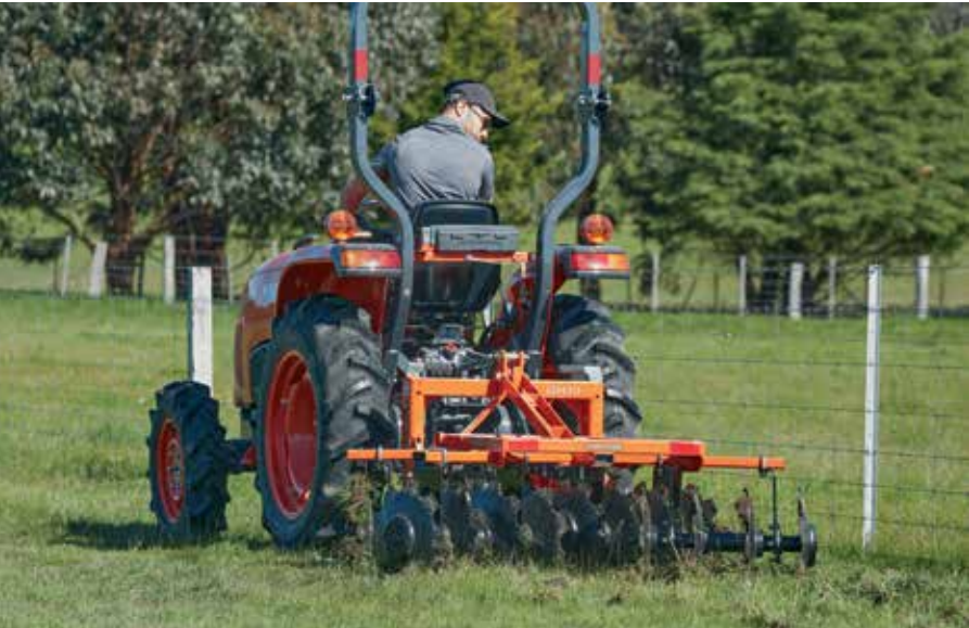
L3200HD – DH1060 Disc Harrow + QH10 Quick Hitch

Indirect injection, 3 or 4-cylinder Kubota diesel engines