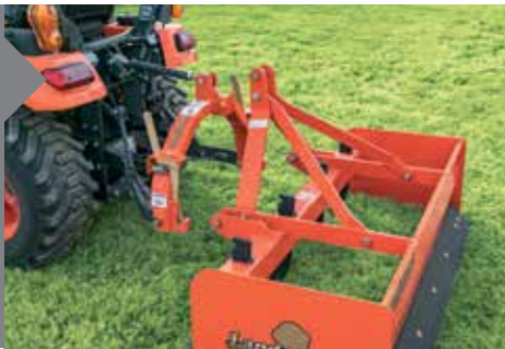
BOX & GRADING SCRAPERS

Make switching between Land Pride implements a breeze with the Land Pride Quick Hitch. The QH05 Quick Hitch is specifically designed for BX tractors while the QH10 is a better match for the B, L and MX Series. Spring loaded levers and automatic locks on the lower link attachment points mean many implements can be changed without leaving the tractor seat.