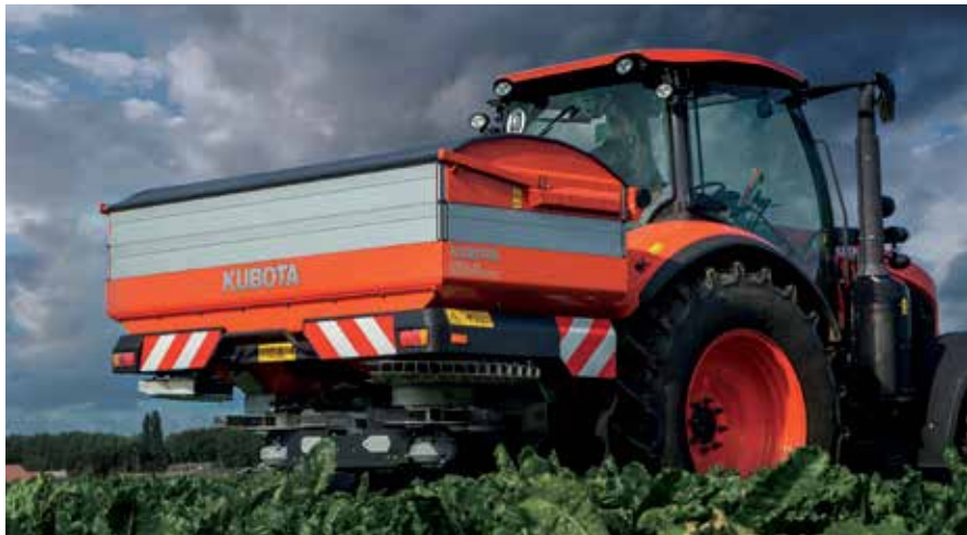
DS DISC SPREADERS

Electrically controlled hopper cover makes opening and closing easy from the drivers seat