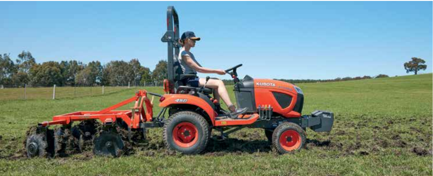
BX2380 - DH1048 Disc Harrow + QH05 Quick Hitch