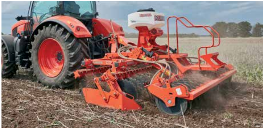
CD COMPACT DISCS

Easily adapted for heavy and sticky soil conditions