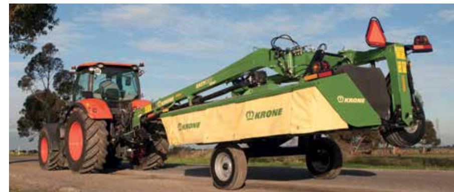
EASYCUT TRAILED CENTRE ECTC400 WITH OPTIONAL TRANSPORT KIT

Steel conditioner design comes from North America (not an M-roll), however suits very well in Australian high crop conditions