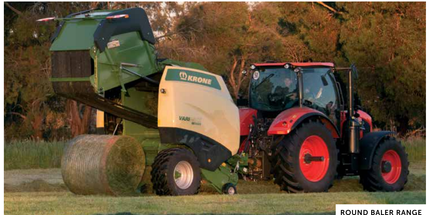
ROUND BALER RANGE

ZX wagon highest capacity silage wagon on the planet