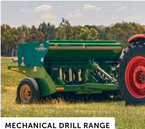
MECHANICAL DRILL RANGE