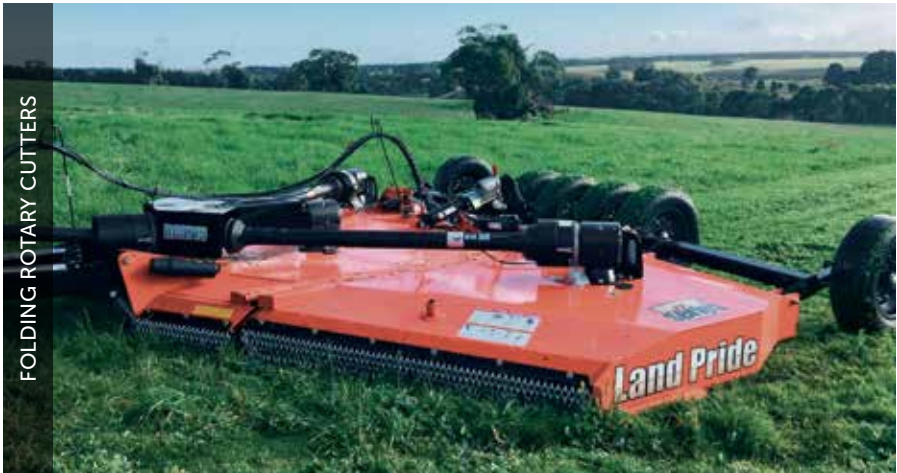
FOLDING ROTARY CUTTERS