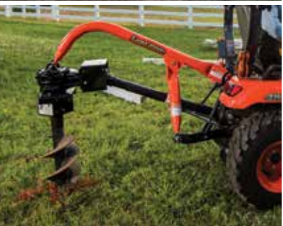
POST HOLE DIGGERS