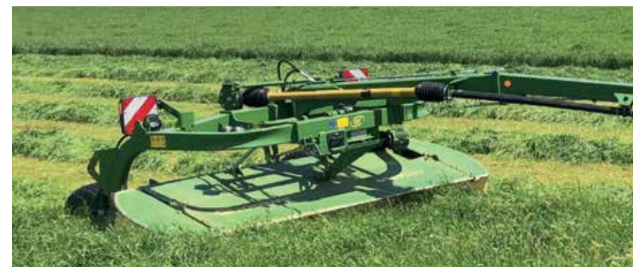
EC TRAILED MOWERS - ECTC320CRS

ECTS360CR/S and ECTS360CV available with a wide working width of 3.6m