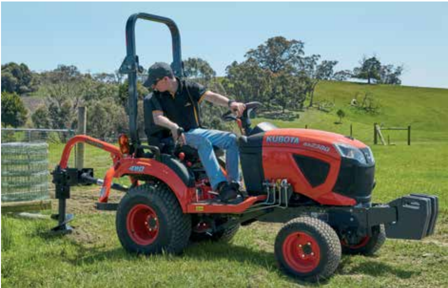
BX2380 - PD10 Post Hole Digger

OPERATOR AREA Deluxe reclining high back seat, spacious operator area, cruise control and easy to reach controls